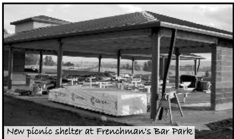
New picnic shelter at Frenchman's Bar Park

Whether you are planning a family, corporate or community event, there is a park that will meet your needs!