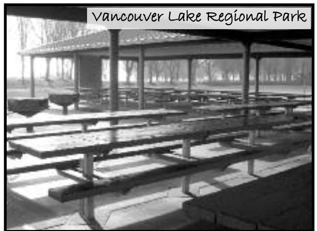
Vancouver Lake Regional Park

Our picnic shelters can accommodate groups of up to 180 people and have a variety of different amenities, including charcoal grills, counters, running water and/or electricity. There are ten more picnic shelters that are always available on a first come, first served basis.