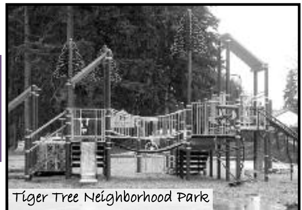
Tiger Tree Neighborhood Park

For more information, visit www.vanclarkparks-rec.org and select "Community Gardens" under the "Facilities & Locations" drop-down menu.